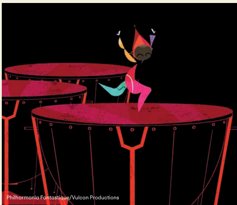
Philharmonia Fantastique/Vulcan Productions