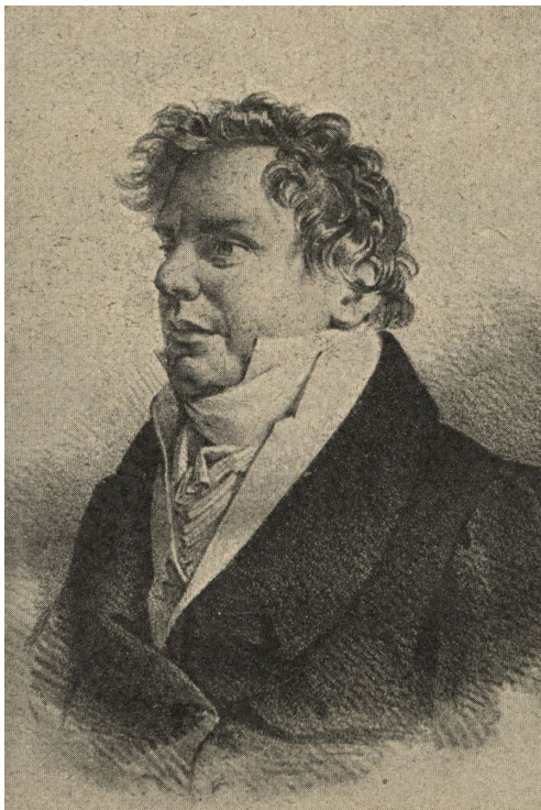
Portrait of Ignaz Schuppanzigh, before 1830. Artist unknown.

Franz Joseph Clement (1780–1842), an Austrian virtuoso, commissioned the Violin Concerto and gave its first performance. He was renowned for his virtuosity and astonishing memory, and his style was characterised by clarity and elegance. He also enjoyed musical stunts, most famously his trick of playing variations on one string of the violin, held upside down!