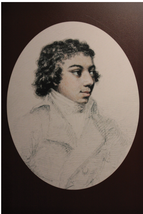
Portrait of George Bridgetower c.1790, by English painter Henry Edridge (1768–1821).