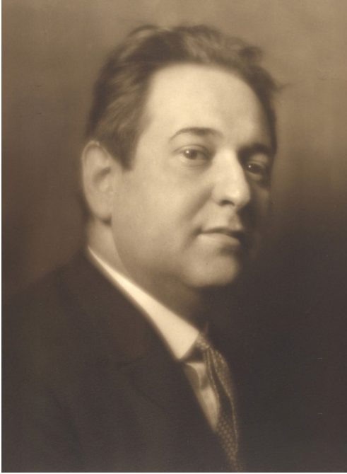
Korngold in 1927.

He was born what is now the Czech city of Brno, but by the age of ten was active in Vienna. Mahler, then director of the Vienna Court Opera, heard some of the ten year-old Korngold's music and pronounced him a genius, recommending the boy study with Alexander von Zemlinsky. Before he had turned 20, Korngold had composed orchestral works, including the still celebrated Sinfonietta , his first two operas, Violanta and Der Ring des Polykrates , and his celebrated incidental music to Shakespeare's Much Ado about Nothing . His music was championed by leading performers of the time: Richard Strauss conducted his orchestral works; pianists like Artur Schnabel performed his solo works widely.