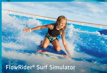
FlowRider® Surf Simulator