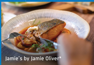
Jamie's by Jamie Oliver*