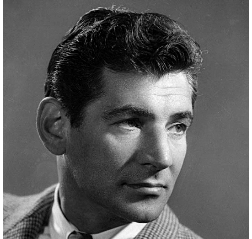
Leonard Bernstein in the 1950s

Bernstein toured internationally as a conductor from the mid-1940s on. The 1950s saw him emerge as an author, and, more momentously, saw him bring classical music to a huge public through television when the Philharmonic's 'Young Peoples Concerts' were telecast with Bernstein conducting and commenting.