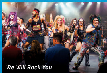
We Will Rock You