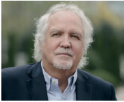
Donald Runnicles Principal Guest Conductor