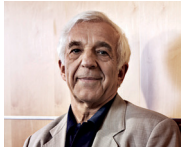
Vladimir Ashkenazy Conductor Laureate