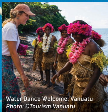
Water Dance Welcome, Vanuatu