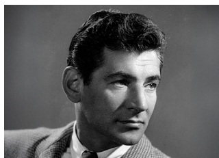
Leonard Bernstein in the 1950s

Contemporary music included Iannis Xenakis' Pithoprakta , Stravinsky's Agon and Poulenc's Dialogues of the Carmelites .