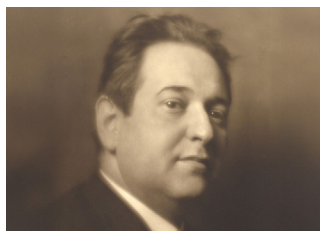
Korngold in 1927.

Contemporary music included Elliott Carter's Piano Sonata, Pierre Boulez's Flute Sonatina and Benjamin Britten's Albert Herring .