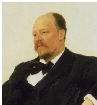
Portrait of the composer Anatoly Konstantinovich Lyadov (1902) by Ilya Repin (1844–1930).

Contemporary music included Sergei Rachmaninov's Third Piano Concerto, Jean Sibelius's Voces Intimae and Richard Strauss's Elektra .