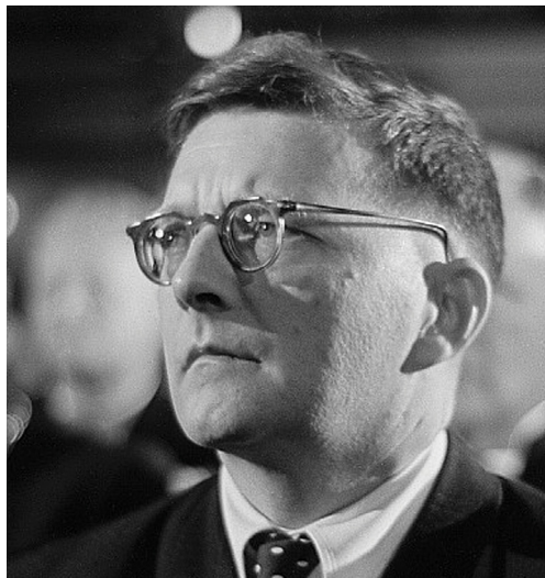
Shostakovich photographed at the Bach Celebration of 28 July 1950.

Despite having enjoyed a spectacularly successful two-year run, Shostakovich's opera Lady Macbeth of Mtsensk was attacked in the pages of Pravda in 1936 as 'chaos instead of music' and its composer warned that 'this could all end very badly'. Shostakovich, or the orchestral management in Leningrad, immediately withdrew his demanding Fourth Symphony, a powerfully disturbing behemoth of dissonance and irony. The composer, like many of his generation, is said to have slept for a time in the hallway of his apartment so that the seemingly inevitable arrest wouldn't traumatise his young family. (Shostakovich suffered several reversals of fortune: he was denounced in 1936, rehabilitated with the premiere of the Fifth Symphony but denounced again in 1948, despite having been awarded the Stalin Prize in 1940 and the Order of Lenin in 1946.)