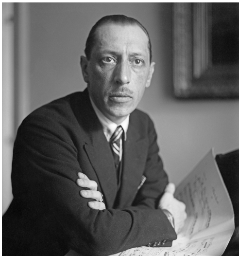
Igor Stravinsky, c.1920-25.

The mid-1930s saw the composition of his Violin Concerto and the ballet Jeu de cartes , and at this time Stravinsky made an increasing number of visits to the United States for concerts and lectures. A new life in the United States beckoned, and the last work he completed in Europe was the American Baroque Dumbarton Oaks .