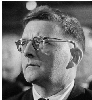
Shostakovich photographed at the Bach Celebration of 28 July 1950.

Contemporary music included Pierre Boulez's Improvisation sur Mallarmé III: A la nue accablante tu , Benjamin Britten's Missa brevis and Peggy Glanville-Hicks's The Glittering Gate .