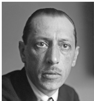
Igor Stravinsky

Contemporary music included Ralph Vaughan Williams's Fantasia on a theme by Thomas Tallis , Gustav Mahler's Ninth Symphony and Giacomo Puccini's La fanciulla del West .