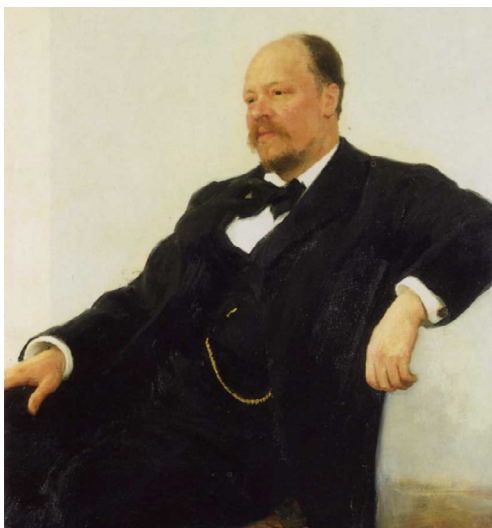
Portrait of the composer Anatoly Konstantinovich Lyadov (1902) by Ilya Repin (1844–1930).

Everything in Liadov’s output is small – not in the forces deployed, but in time-scale. There are many piano pieces, songs, some choral music and a dozen orchestral pieces, but the lengthiest work would be about 20 minutes long. This is not because he was tidy-minded, or agonised over every note, as Ravel did. He had grand musical ambitions, but lacked the energy or will to carry them out.