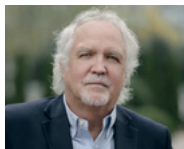
Donald Runnicles Principal Guest Conductor