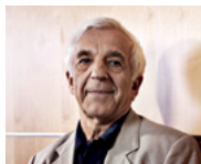
Vladimir Ashkenazy Conductor Laureate