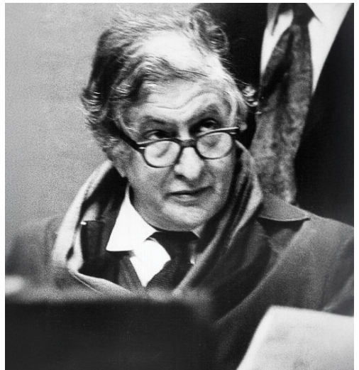
Bernard Herrmann c.1970.