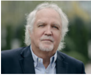
Donald Runnicles Principal Guest Conductor