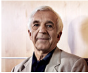
Vladimir Ashkenazy Conductor Laureate