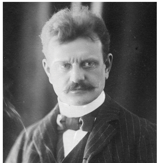
A photo of Sibelius c. 1900, taken by Daniel Nyblin. Source: Finnish Heritage Agency.