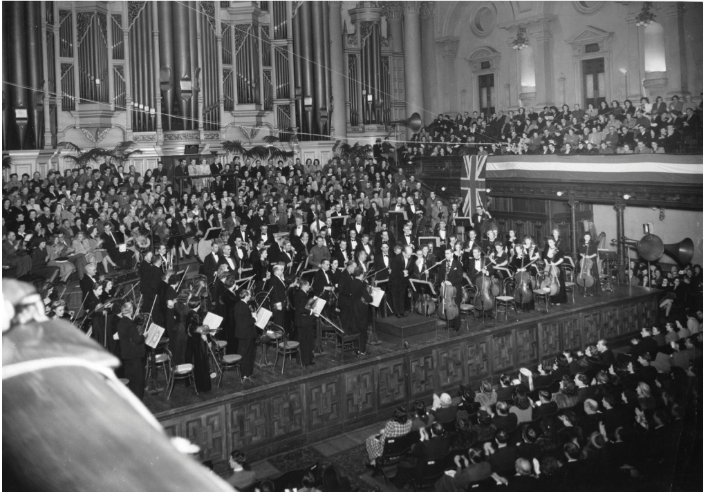
The Sydney Symphony Orchestra performs at Sydney Town Hall in 1944, led by the great Hungarian-born American conductor Eugene Ormandy.