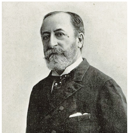
Photograph of Camille Saint-Saëns circa 1880.