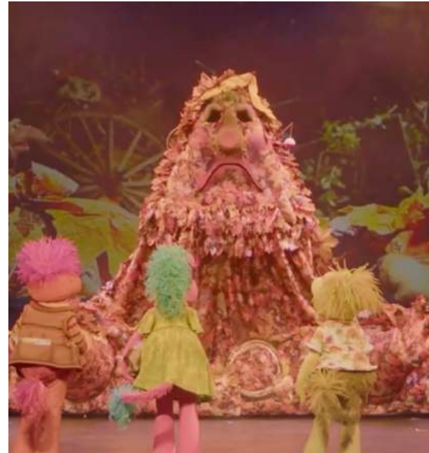
Marjory the Trash Heap (large scale puppet)

Now my life is different every day Now I live my life a better way Every time the clouds start showing through I just grab my paints and paint them blue