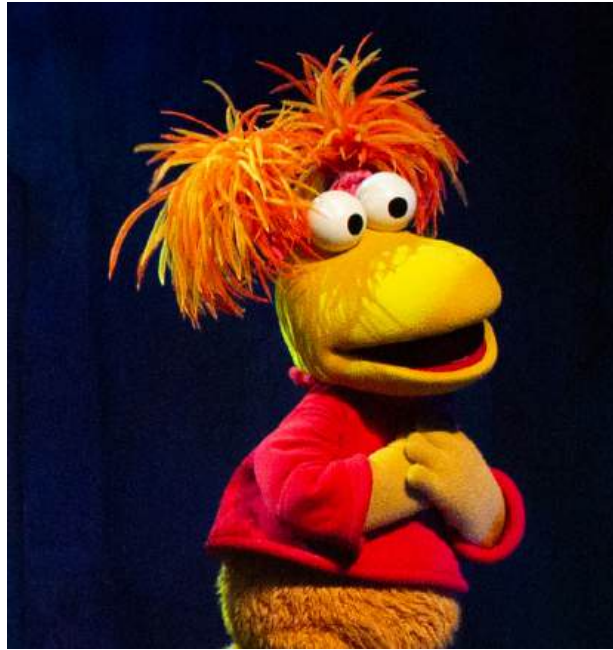
Red (walk around puppet)

"I'm just looking forward to a day of no unexpected surprises. Just me and my laundry. Calm cleanliness. A nice quiet day here in Fraggle Rock."