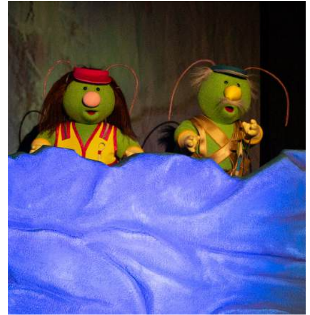
Doozers (hand puppets)

"I'm always twirling, diving, "let's get goin!"