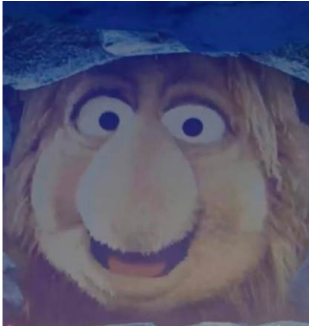
Junior Gorg (on screen only puppet)

Now my life is different every day Now I live my life a better way Every time the clouds start showing through I just grab my paints and paint them blue