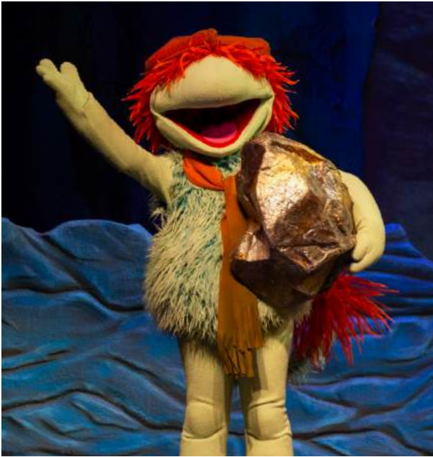
Boober (walk around puppet)

"I'm just looking forward to a day of no unexpected surprises. Just me and my laundry. Calm cleanliness. A nice quiet day here in Fraggle Rock."