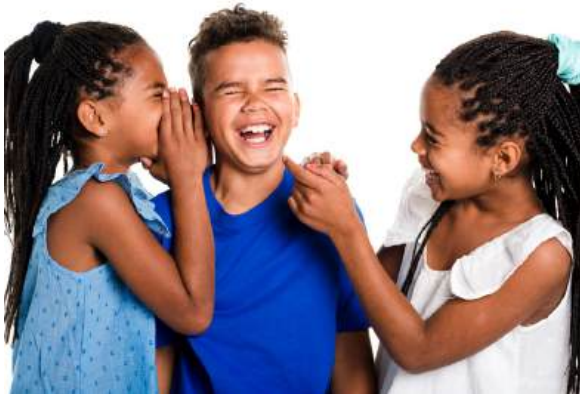
Vocalize or chat with a neighbor